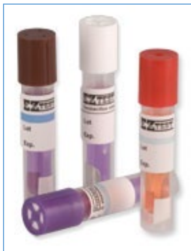
Figure 3: typical Geobacillus Stearotherophilus Glass ampoules (liquids)