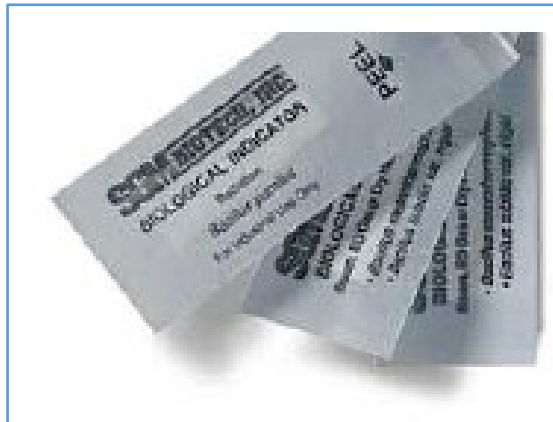
Figure 2: typical Geobacillus Stearotherophilus EZ-test ampoules