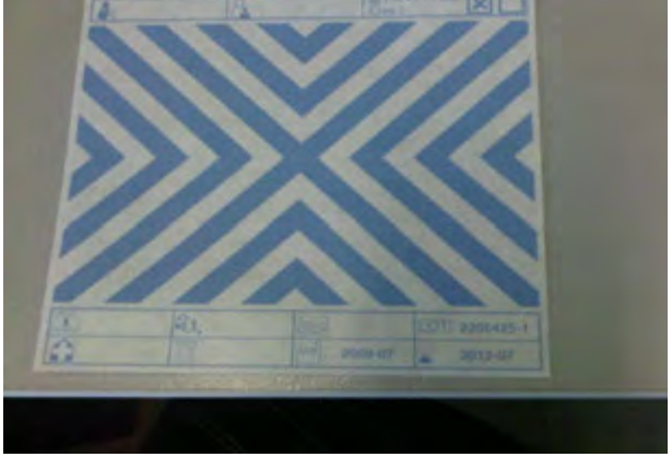
Figure 1. Test sheet BEFORE processing (Blue colour) Figure 2. Test sheet showing PASS condition (Pink colour)